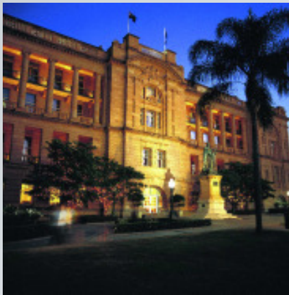
The Riverlife Adventure Centre (above) and Conrad Treasury.

Boyd-Boland, considers Brisbane a promising candidate for the prestigious gathering, which Sydney captured once before in 2003. "Australia is highly regarded internationally, it can point to numerous successfully handled big events, and last but not least it also enjoys an excellent reputation for its high standards of dentistry."