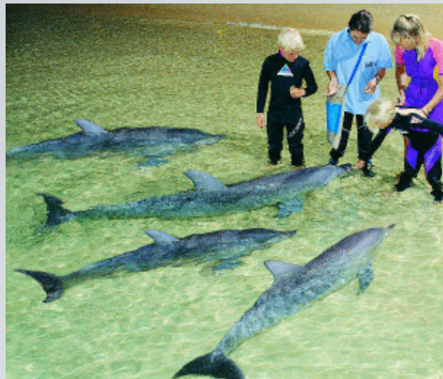
Moreton Island, whose special attraction is wild dolphins.

The capital of Queensland has changed enormously over the past 20 years. The construction boom took off in