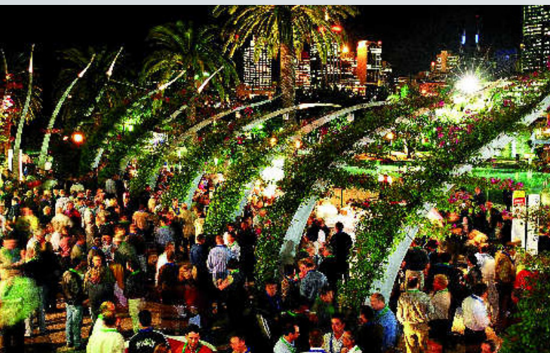
BCEC: South Bank Function.